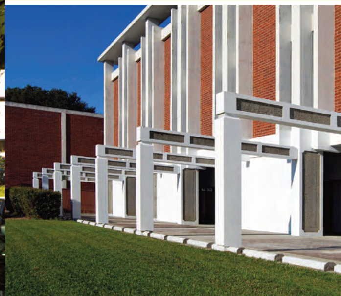
Contra Costa College Liberal Arts Building