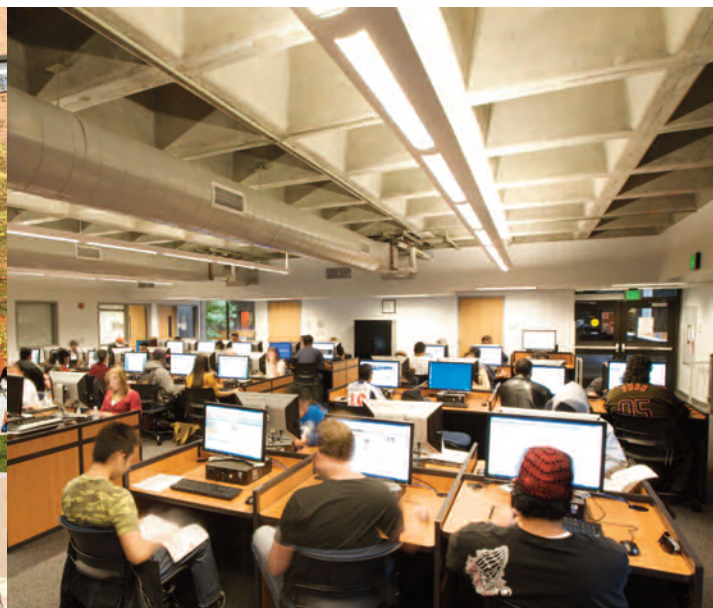
Los Medanos College Core Building

Above: Rendering of Diablo Valley College Commons Project by Steinberg Architects