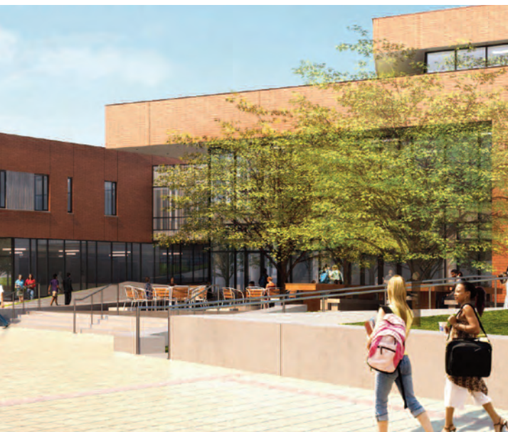
Diablo Valley College Commons

A number of the projects completed in 2009 are structural in nature, involving severely needed upgrades of aging facilities and physical plant. Others, however, are more transformational in their outward look and character. All of these bond-financed projects are designed to make the college campuses more attractive, comfortable, and welcoming to students, faculty, and staff.